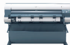
W8400 B0 output

SUPERIOR PRINT QUALITY ONLY COMES WITH CANON INK AND MEDIA