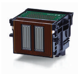
Canon's ingenious 1" wide print head ensures outstanding colour quality and print speed.