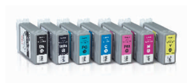
The 7-colour printing process leads to enhanced colour precision and greater tonal depth.