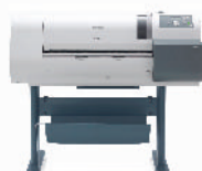
W6400 A1 output