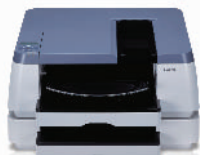
W2200 A3+ output