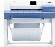
W7200 AO output